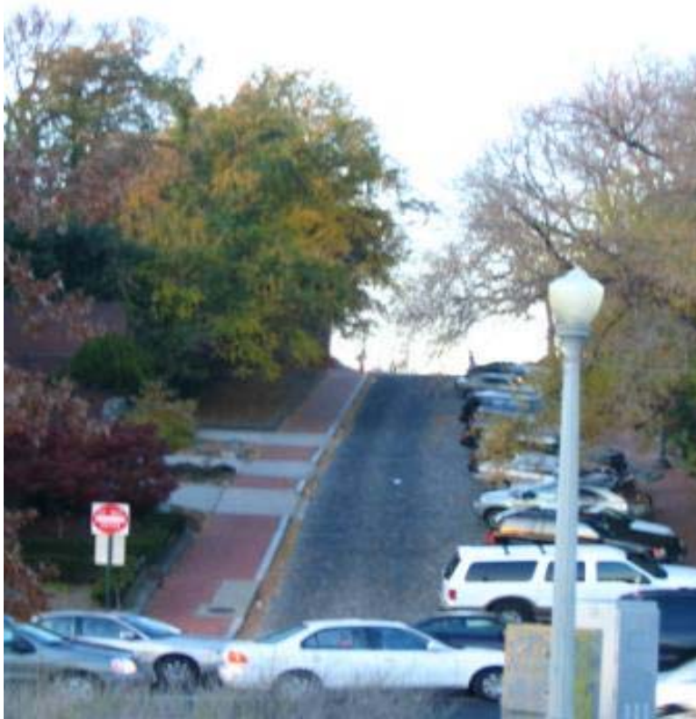
This uphill platform is much steeper than the first one. Ouch.

But you should think of doing something different if one of your needs is to transform your legs to a better shape and make them stronger.